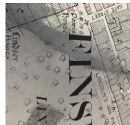
Street map (example) Vintage map (example) Mylar (example)

Colour Tektura Studio digitally printed maps are available in the colours shown, or can be tinted (Vintage/Street) or recoloured if appropriate. Any map can be printed onto a Mylar base.