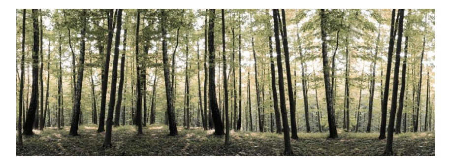
Green Trees : Max print size 8776mm x 2870mm. Can be repeated to fill longer wall

Yellow Trees : Max print size 4190mm x 2800mm. Can be repeated to fill longer wall